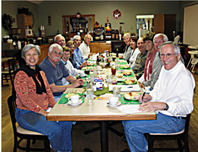
The UP Fall Color group of October 2010