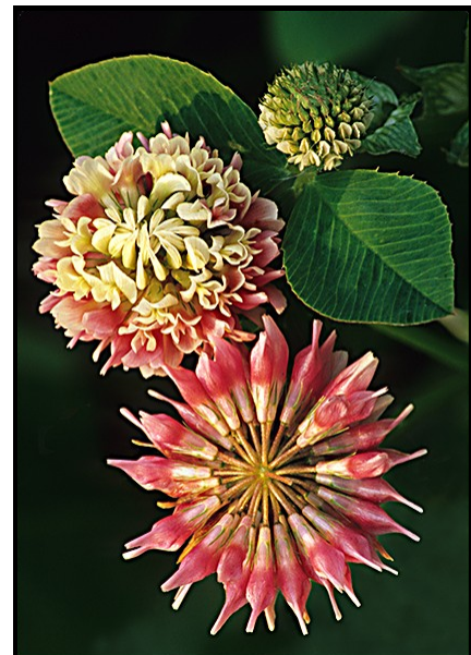
Clover—Bud to Bloom by Don Bolak