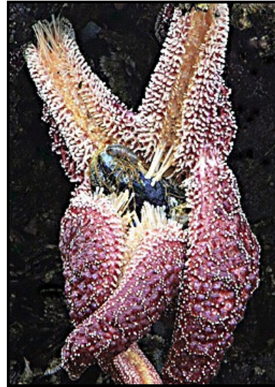
Starfish Eating Mussel