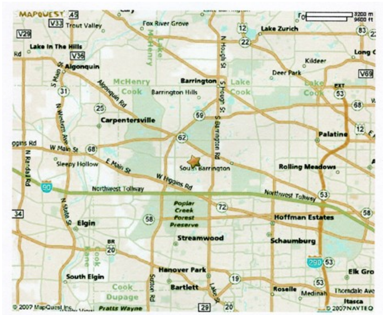
Picnic map large. The star locates the Bodkin's home.